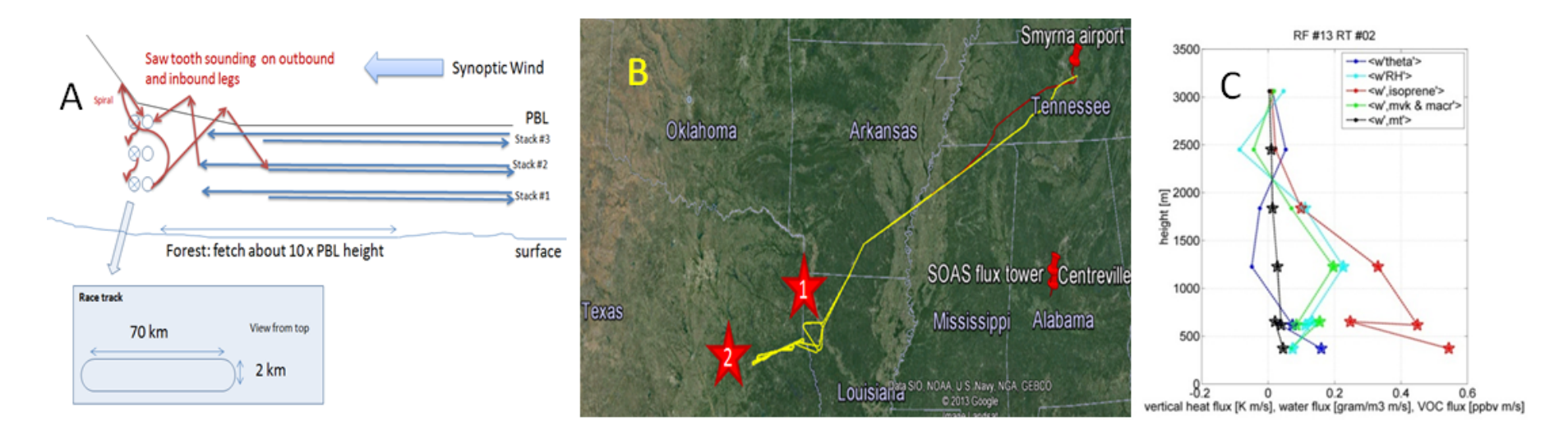
Figure 2. Panel A: Flux profiling flight pattern with stacked racetrack patterns (3 to 5 levels) with a sawtooth sounding on the inbound and outbound legs. Panel B: Example of C-130 flight track with stacked racetracks over Texas. Panel C: Vertical profiles of fluxes of water (w'RH'), sensible heat (w'theta'), isoprene (w'isoprene'), total monoterpenes (w'mt'), and isoprene oxidation products (w'mvk&macr') over Texas site #2