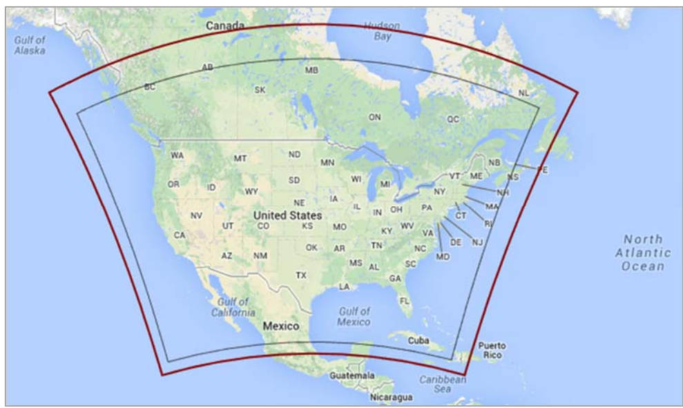
Figure 4. 36 km WRF (red) and CAMx (blue) modeling domains. Figure from <a href="http://www.tceq.texas.gov/airquality/airmod/rider8/modeling/domain">http://www.tceq.texas.gov/airquality/airmod/rider8/modeling/domain</a>.

meteorological modeling applications. Depending on the outcome of the evaluation, ENVIRON may elect to refine the WRF model physics and/or nudging options in order to improve model performance over the 12 km grid.